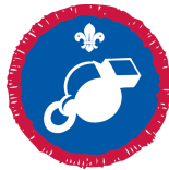
Physical Recreation Activity Badge