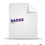
Scientist Activity Badge