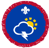
Meteorologist Activity Badge