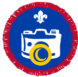
Photographer Activity Badge