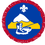
Hill Walker Activity Badge