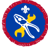
Mechanic Activity Badge