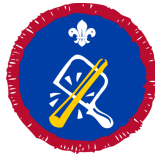
Model Maker Activity Badge