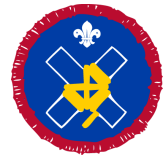
Pioneer Activity Badge