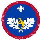
Naturalist Activity Badge