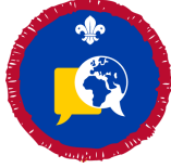
Global Issues Activity Badge