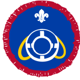
Lifesaver Activity Badge