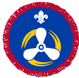
Power Coxswain Activity Badge