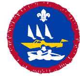
Water Activities Activity Badge

<< First (?cat=7,64,779&pg=1) < Prev (?cat=7.64.779&pg=1) 1 (?cat=7.64.779&pg=1) . 2 , 3 (?cat=7,64,779&pg=3) Next > (?cat=7,64,779&pg=3) Last >> (?cat=7,64,779&pg=3)