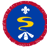
Survival Skills Activity Badge