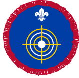
Master At Arms Activity Badge