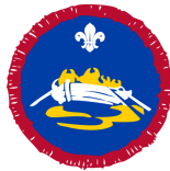
Pulling (Fixed Seat Rowing) Activity Badge