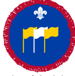
International Activity Badge