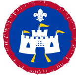
Local Knowledge Activity Badge