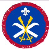
Snowsports Activity Badge