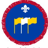
International Activity Badge