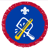
Model Maker Activity Badge