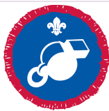
Physical Recreation Activity Badge