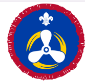
Power Coxswain Activity Badge