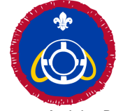
Lifesaver Activity Badge