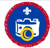
Photographer Activity Badge