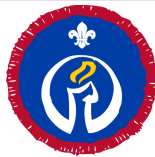
My Faith Activity Badge