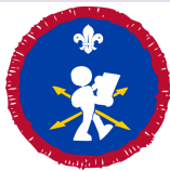
Orienteer Activity Badge