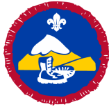
Hill Walker Activity Badge