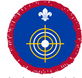
Master At Arms Activity Badge