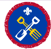
Smallholder Activity Badge