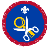
Hobbies Activity Badge