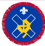
Pioneer Activity Badge