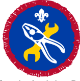
Mechanic Activity Badge