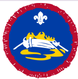
Pulling Activity Badge