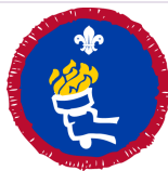
Sports Enthusiast Activity Badge