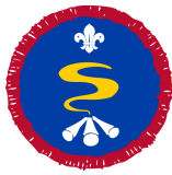
Survival Skills Activity Badge