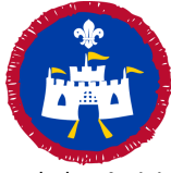
Local Knowledge Activity Badge