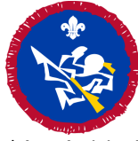
Martial Arts Activity Badge