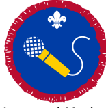
Media Relations and Marketing Activity Badge