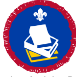
Librarian Activity Badge