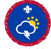
Meteorologist Activity Badge