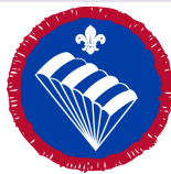
Parascending Activity Badge